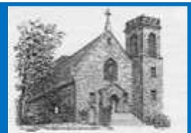
St. Gabriel's Church 78 Shethar St. Hammondsport, NY 14840