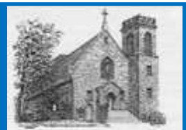
St. Gabriel's Church 78 Shethar St. Hammondsport, NY 14840