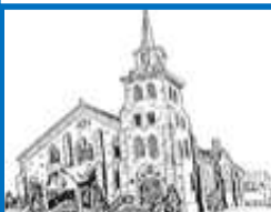
St. Mary's Church 32 East Morris St. Bath, NY 14810

Celebrations of the Lord's Day Saturday 4:00 pm at St. Mary's Church Sunday 8:00 am at St. Gabriel's Church 10:00 am at St. Mary's Church