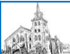
St. Mary's Church 32 East Morris St. Bath, NY 14810

Celebrations of the Lord's Day Saturday 4:00 pm at St. Mary's Church Sunday 8:00 am at St. Gabriel's Church 10:00 am at St. Mary's Church