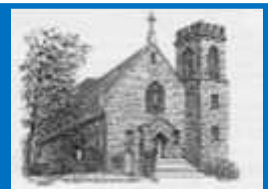
St. Gabriel's Church 78 Shethar St. Hammondsport, NY 14840