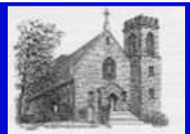
St. Gabriel's Church 78 Shethar St. Hammondsport, NY 14840