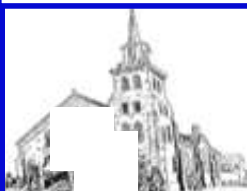
St. Mary's Church 32 East Morris St. Bath, NY 14810

Celebrations of the Lord's Day Saturday 4:00 pm at St. Mary's Church Sunday 8:00 am at St. Gabriel's Church 10:00 am at St. Mary's Church