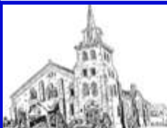
St. Mary's Church 32 East Morris St. Bath, NY 14810

Celebrations of the Lord's Day Saturday 4:00 pm at St. Mary's Church Sunday 8:00 am at St. Gabriel's Church 10:00 am at St. Mary's Church