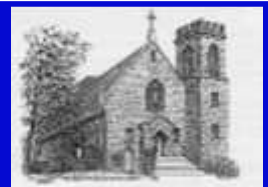
St. Gabriel's Church 78 Shethar St. Hammondsport, NY 14840