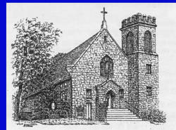
St. Gabriel's Church 78 Shethar St. Hammondsport, NY 14840

The Sacrament of Reconciliation is available: * Saturday at 3:00pm at St. Mary's Church or * By appointment by calling the parish office