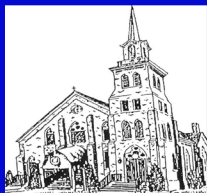
St. Mary's Church 32 East Morris St. Bath, NY 14810