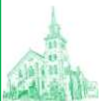
St. Mary's Church 32 East Morris Street Bath, New York 14810