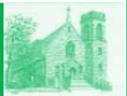
St. Gabriel's Church 78 Shethar Street Hammondsport, NY 14840

Word & Worship Service - Tuesday- 8:30 am at St. Gabriel's Church