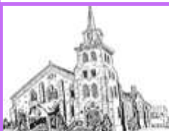
St. Mary's Church 32 East Morris St. Bath, NY 14810

Celebrations of the Lord's Day Saturday 4:00 pm at St. Mary's Church Sunday 8:00 am at St. Gabriel's Church 10:00 am at St. Mary's Church