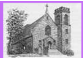
St. Gabriel's Church 78 Shethar St. Hammondsport, NY 14840