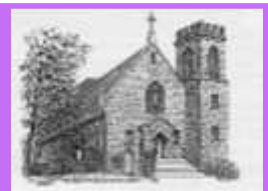
St. Gabriel's Church 78 Shethar St. Hammondsport, NY 14840