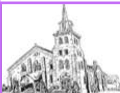
St. Mary's Church 32 East Morris St. Bath, NY 14810

Celebrations of the Lord's Day Saturday 4:00 pm at St. Mary's Church Sunday 8:00 am at St. Gabriel's Church 10:00 am at St. Mary's Church