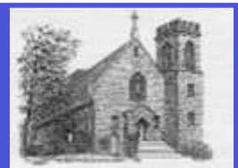
St. Gabriel's Church 78 Shethar St. Hammondsport, NY 14840