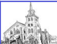
St. Mary's Church 32 East Morris St. Bath, NY 14810

Celebrations of the Lord's Day Saturday 4:00 pm at St. Mary's Church Sunday 8:00 am at St. Gabriel's Church 10:00 am at St. Mary's Church