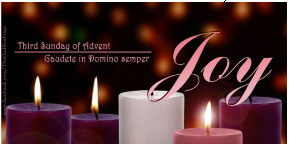
Rejoice in the Lord always; again I say, rejoice. Indeed, the Lord is near.