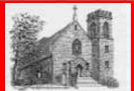
St. Gabriel's Church 78 Shethar St. Hammondsport, NY 14840