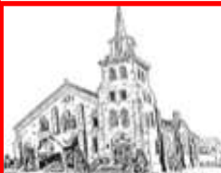
St. Mary's Church 32 East Morris St. Bath, NY 14810

Celebrations of the Lord's Day Saturday 4:00 pm at St. Mary's Church Sunday 8:00 am at St. Gabriel's Church 10:00 am at St. Mary's Church