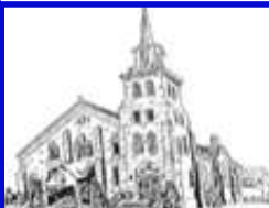
St. Mary's Church 32 East Morris St. Bath, NY 14810

Celebrations of the Lord's Day Saturday 4:00 pm at St. Mary's Church Sunday 8:00 am at St. Gabriel's Church 10:00 am at St. Mary's Church