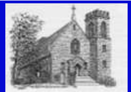
St. Gabriel's Church 78 Shethar St. Hammondsport, NY 14840